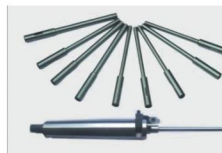
Standard (dia. Φ 6.95-Φ 12.05) and special pilots can be chosen which is use for all kinds of valve guide.