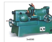
Valve seats grinder (optional equipment)