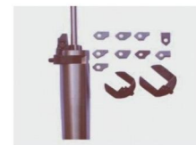
One angle cutter and multi-angle cutter can bore 3 angles at the same time. Finishing will be high precision and smooth surface.