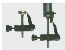
Convenient and precision cutter adjusting.